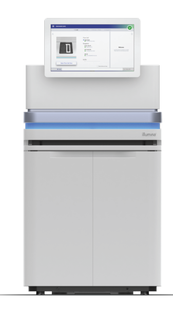
Figure 1: The NovaSeq 6000 System—Transforming sequencing by combining throughput, flexibility, and ease of use for virtually any method, genome, and scale.

The NovaSeq 6000 System provides access to a powerful, highthroughout genomics solution that empowers users to perform studies at the throughput and price per sample that meets their research objectives.