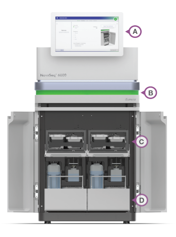
Figure 3: The NovaSeg 6000 System Provides Straightforward Operation-Many features of the NovaSeg 6000 System are designed to simplify genomic studies, including (A) intuitive touch screen interface, (B) lighted LED display indicates flow cell status, (C) snap-in cartridges contain ready-to-use reagents, and (D) waste containers that can be easily removed for disposal.

The NovaSeg 6000 System forms the cornerstone of a sequencing ecosystem that encompasses workflow management, manual or automated library preparation, sequencing, data analysis and interpretation, and service and support (Figure 4).