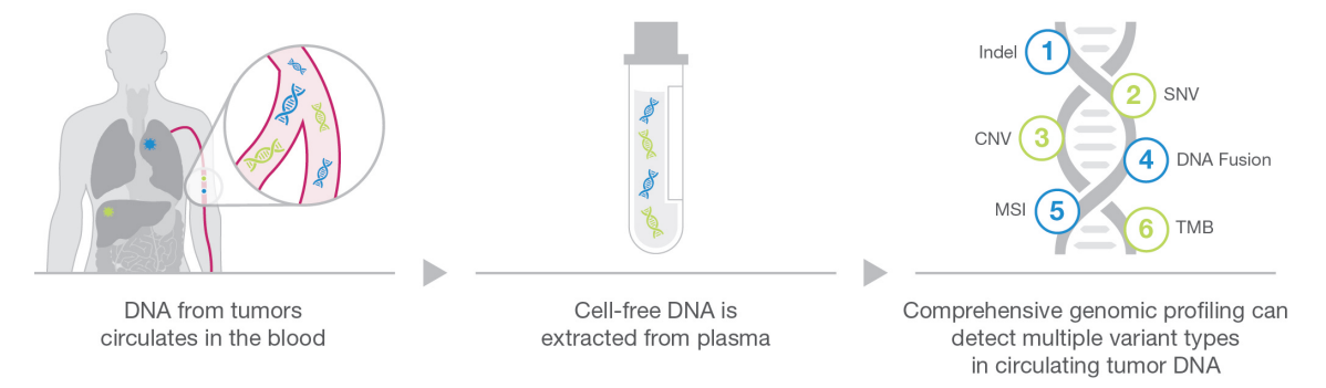
Figure 1: New molecular methods can assess numerous biomarkers and numerous tissues from plasma samples—Comprehensive genomic profiling, which is now possible from cfDNA, consolidates hundreds of markers into a single assay.

Although ctDNA coming from a specific tissue source represents only a small fraction of total cfDNA, cfDNA analysis has been refined well enough to become a tool for assessing tumor heterogeneity and overcoming tissue sampling bias. During monitoring of disease progression, ctDNA analysis can monitor response to treatment in the original tumor location, and also assess metastasis to other locations in the body. With the use of sequencing methods that can identify new mutations, liquid biopsy can be especially useful for monitoring acquired resistance arising from new mutations. With the development of sensitive assays that assess numerous genes in a single assay, cfDNA can be used for comprehensive tumor profiling. Thus, liquid biopsy can not only identify new mutations during disease progression, but also mutations arising in new tissues outside of the original tumor source.