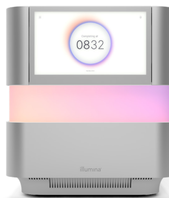
Table 1: Performance parameters for the NextSeq 1000 and 2000 Sequencing Systems

Figure 1: The NextSeq 2000 Sequencing System —The latest NGS system from Illumina offers innovative design features, advanced chemistry, simplified bioinformatics, and an intuitive workflow that enable the widest range of applications on a benchtop sequencing system.